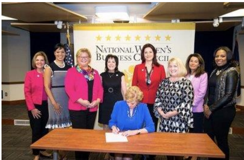
U.S. Small Business Administrator Linda McMahon signed each respective Council member's Oath of Office at NWBC's Swearing In Ceremony on March 28, 2019

NWBC celebrated Women's History Month by recognizing the 12.3 women-owned firms accounting for 40% of all businesses! The Council also participated in various events and meetings throughout the Month of March.