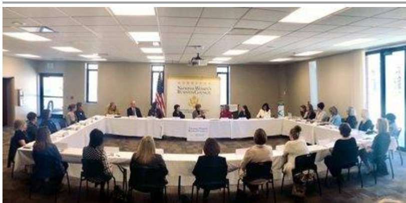
NWBC Small Business Roundtable at Central College in Pella, IA